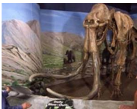
The local Mammoth – part of the Discovery Centre Display