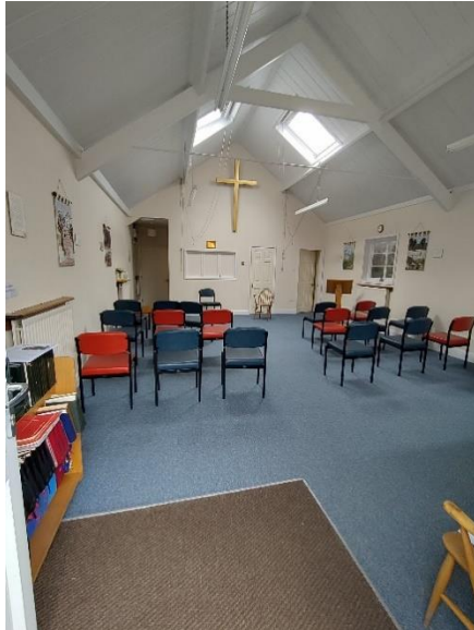
Pilgrim Centre Hall