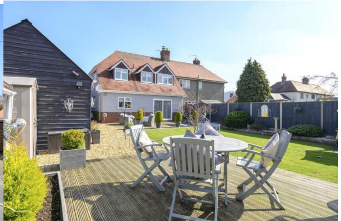
Greenfields Road, Craven Arms, SY7

Approximate Area = 1278 sq ft / 118.7 sq m Limited Use Area(s) = 39 sq ft / 3.6 sq m Garage = 320 sq ft / 29.7 sq m Outbuilding = 288 sq ft / 26.8 sq m Total = 1905 sq ft / 176.9 sq m