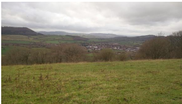
View over Craven Arms New Year's Eve 2021